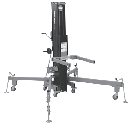
(1) Available aftermarket only